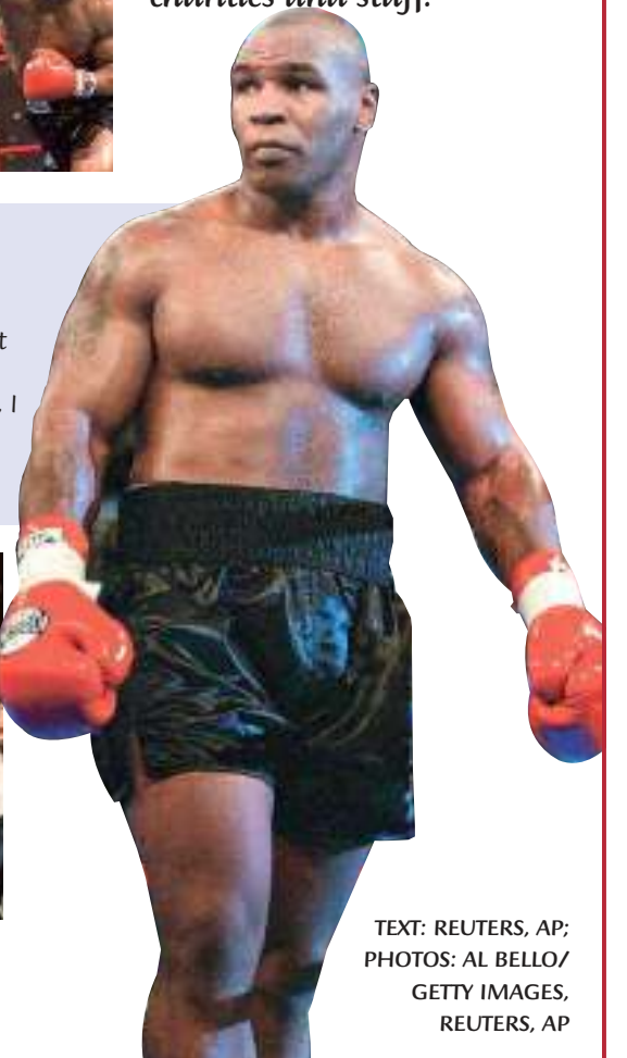
TEXT: REUTERS, AP