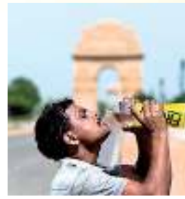
A man quenches his thirst amid rising temperatures in New Delhi.

In large areas, a heatwave is declared when the maximum temperature is 45 degrees Celsius for two days consecutively. A severe heatwave is declared when the maximum temperature is 47 degrees Celsius or more for two days at a stretch. In small areas like Delhi, a heatwave is declared if the temperature touches 45 degrees Celsius even for a single day, according to the IMD.