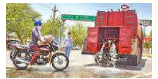
A municipal truck sprays water on the road on a hot summer afternoon, in Churu.

Daytime temperatures over the past few days: Most of Rajasthan: Around 45-47 degrees Celsius Churu, Rajasthan: 50 degrees Celsius Parts of New Delhi: 47.6 degrees Celsius Punjab and Haryana: Nearly 46 degrees Celsius Allahabad, UP: 46.3 degrees Celsius